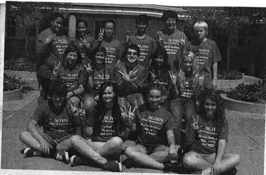
Marsh Junior High School peer mediators are ready to assist their classmates. Students can call the Bully Hotline at (530) 895-4110 ext. 400.

If your child shares with you a bullying incident that occurred at school, discuss ways your child can deal with the situation and how he can protect himself. Your child needs to know that he isn't alone, that other kids have also had the same experiences, and that bullying is not acceptable behavior.